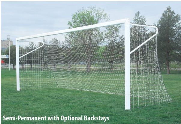
Semi-Permanent with Optional Backstays

Available in five sizes, these goals feature 4" square aluminum extrusion uprights and crossbars with a white powder coated finish and are designed for direct ground bury in 30" deep footings or order optional SC44S ground sleeves for removable installation. European backstay supports are standard. Order nets separately. Call for details.