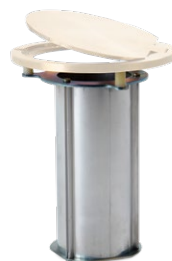
Aluminum Floor Socket

Order sockets and floor plates individually for volleyball systems. Choose 3", 3 1/2" or 4" extruded aluminum sockets. Then choose hinged brass, lockable hinged brass, machined aluminum or chrome plated swivel style floor plate. Order one for each pole.