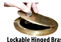
Lockable Hinged Brass